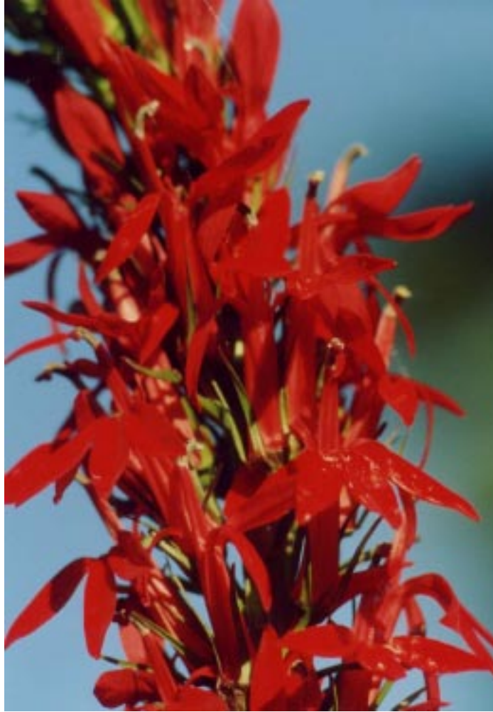
Cardinal Flower - mid August. The prevalence of the cardinal flower is cyclical depending on low water levels exposing the shoreline