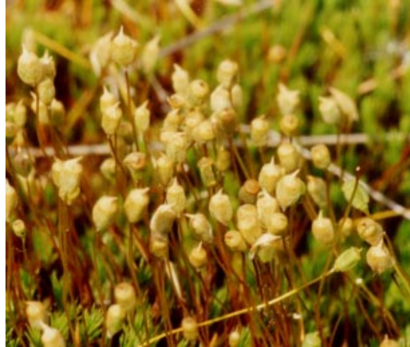
Moss Flowers - early June 2002