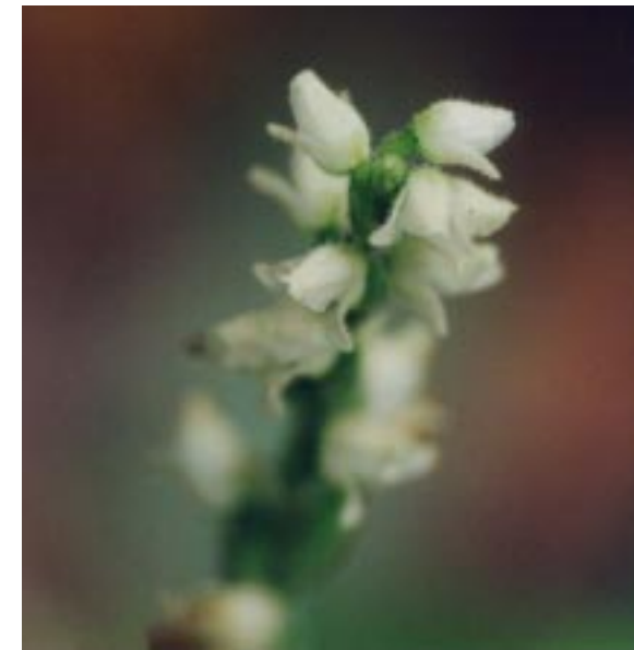
flowers in mid July August