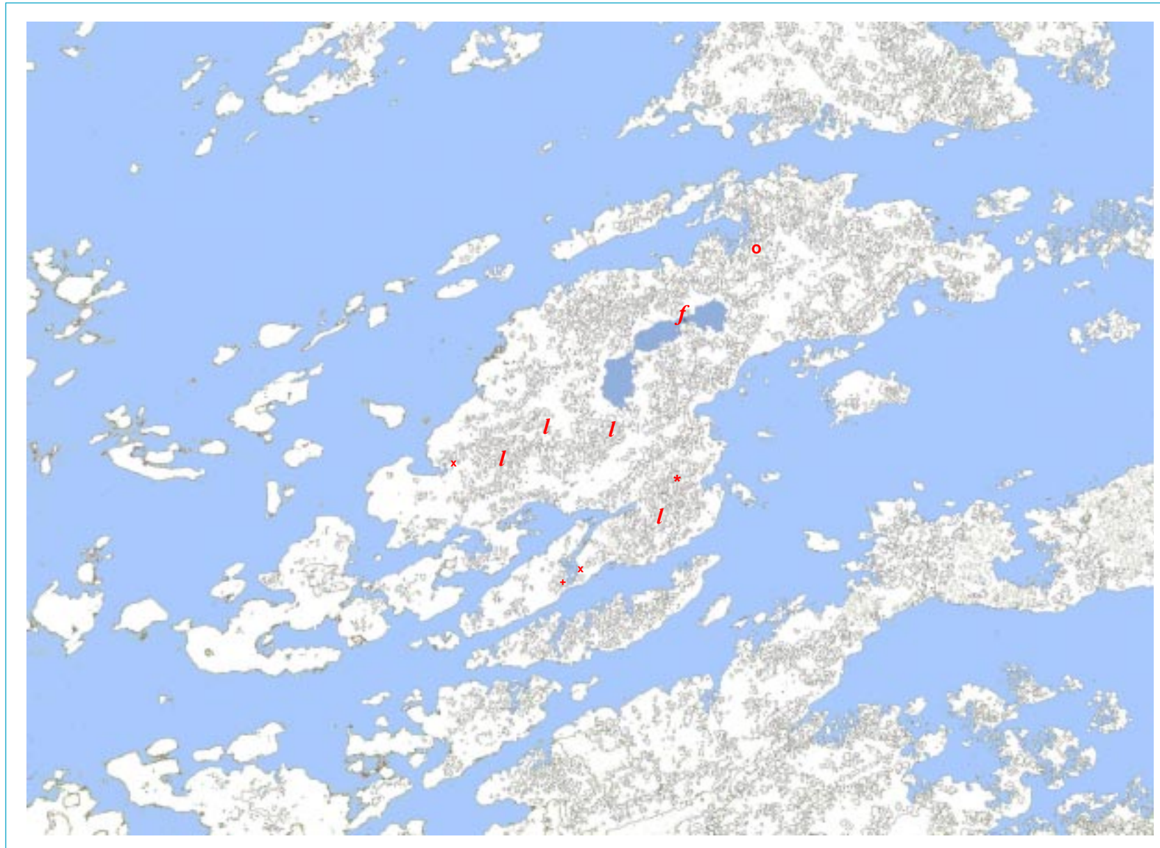
LOCATION MAP - RARE AND UNUSUAL PLANTS