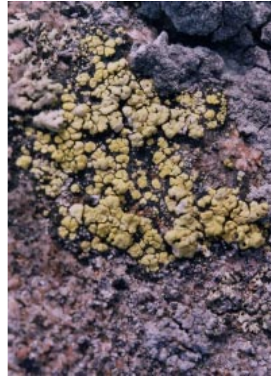
Lichens in Detail - Lichens are a combination of algae and of bacteria.