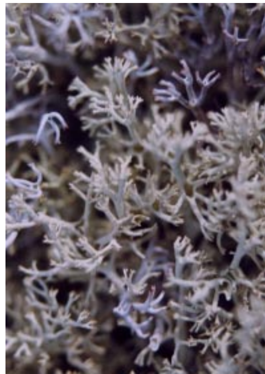
Reindeer Moss - early June