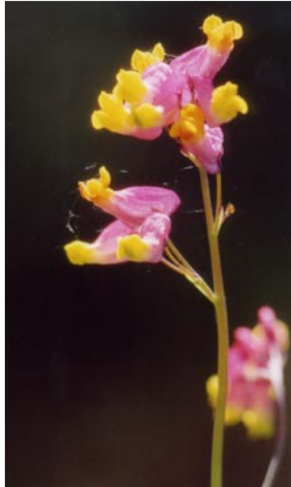
Corydalis in early June