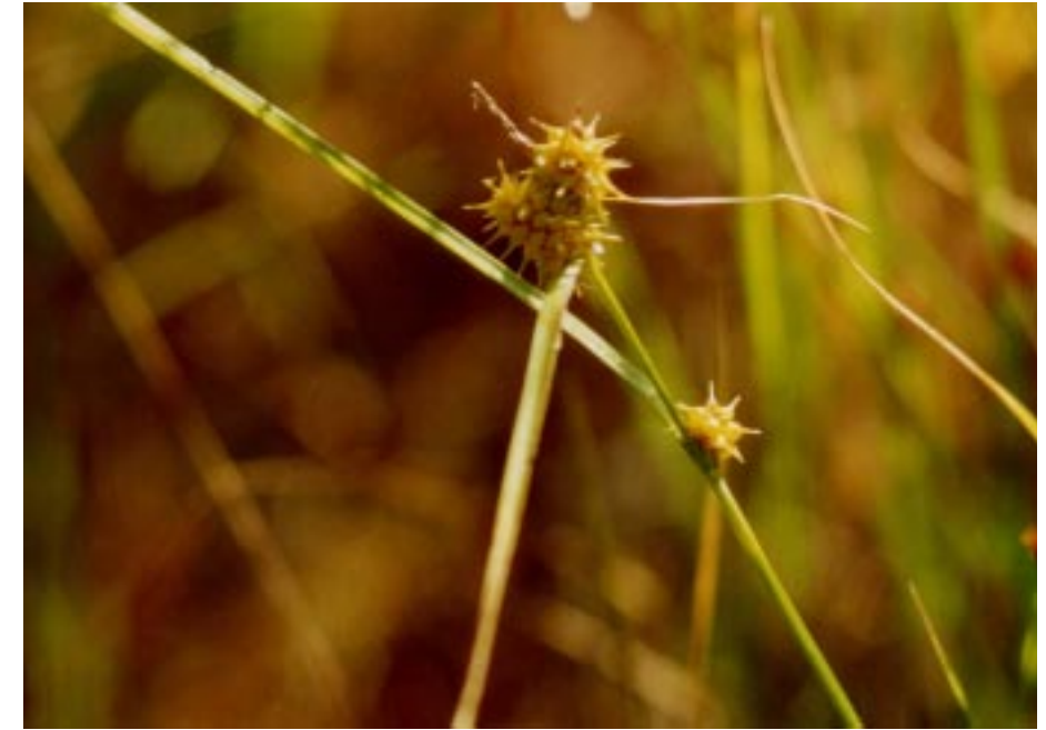
Reed SeedPod in Archers Bay - mid August