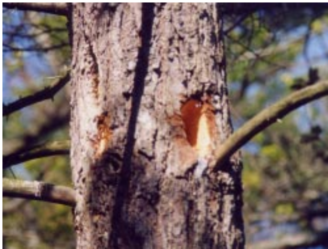
Pilated Woodpecker rectangular holes in pine 50mm x 100mm