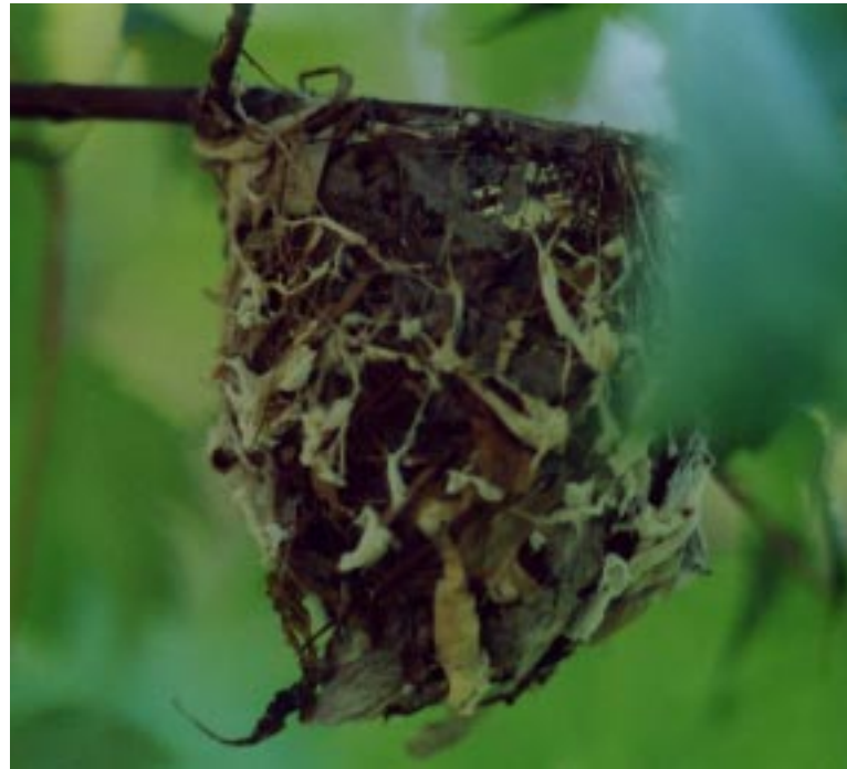
Red Eyed Vireo suspended nest woven of dry leaves - in gulch beyond Bat Park low nest approximately 1800mm above blueberry bushes.