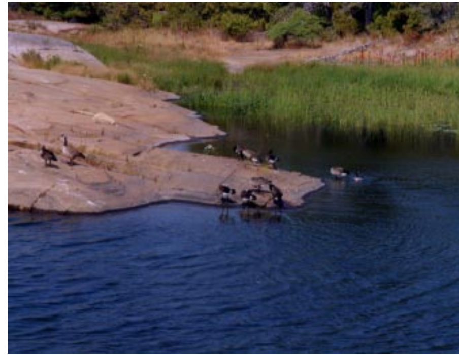
Canada Geese congregate in Archers Bay in late summer seeking wild rice