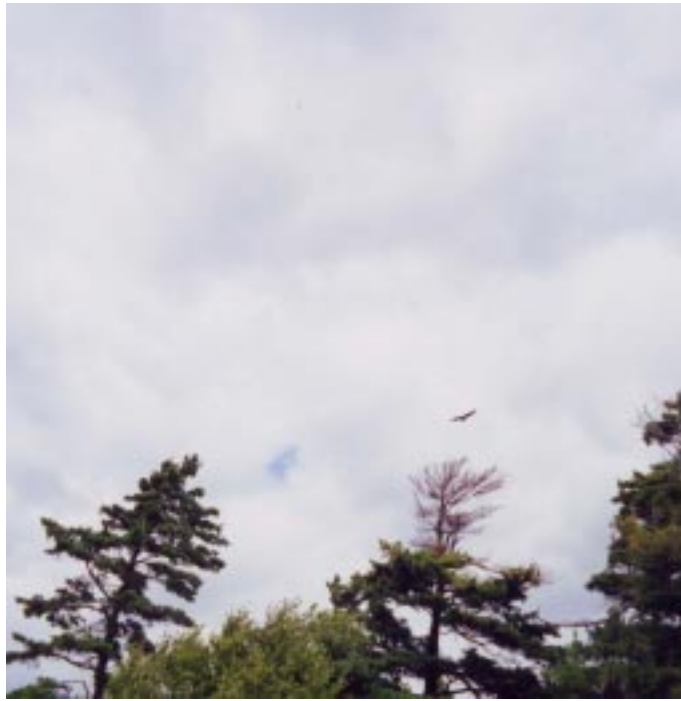
Turkey Vulture nested on Armak Point