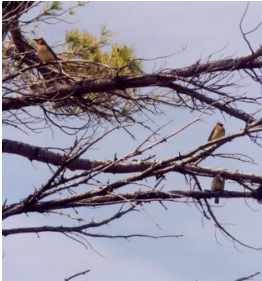
Cedar Waxwings Group of 5-6 Spring 2002 Champlain Park