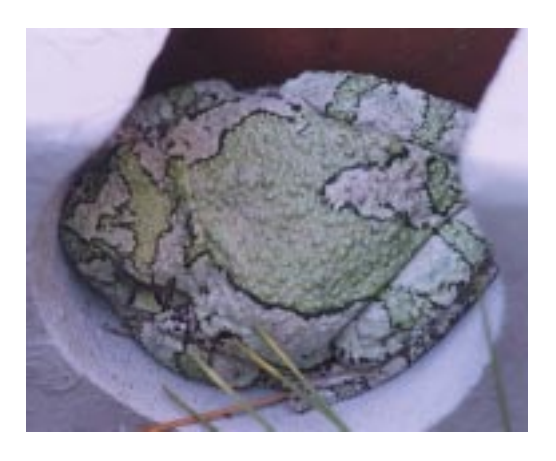
Grey Tree Frog - ëLord Lichenberryí nestled into scroll on Pagoda Porch