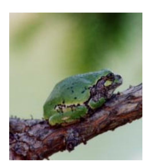
Tree Frog on white spruce bough