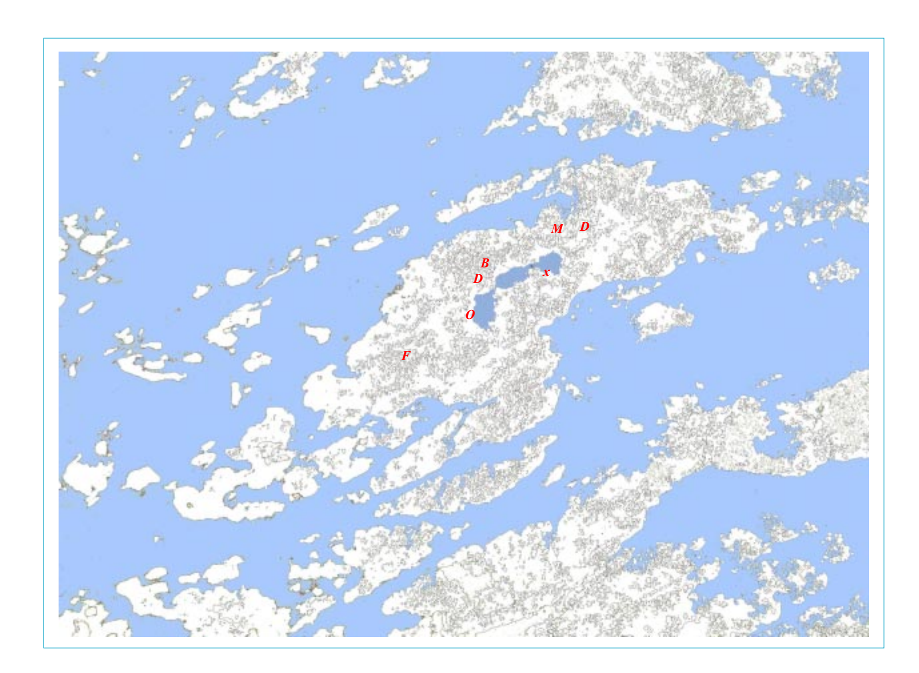
LOCATION MAP - ANIMAL NOTES