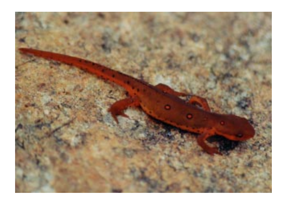
Red Eft in ëTerrestrial Stageí These newts lay their eggs and produce their babies in pond water. They migrtate to the land and this one was found in the vegetable garden. They return to the water to mate.